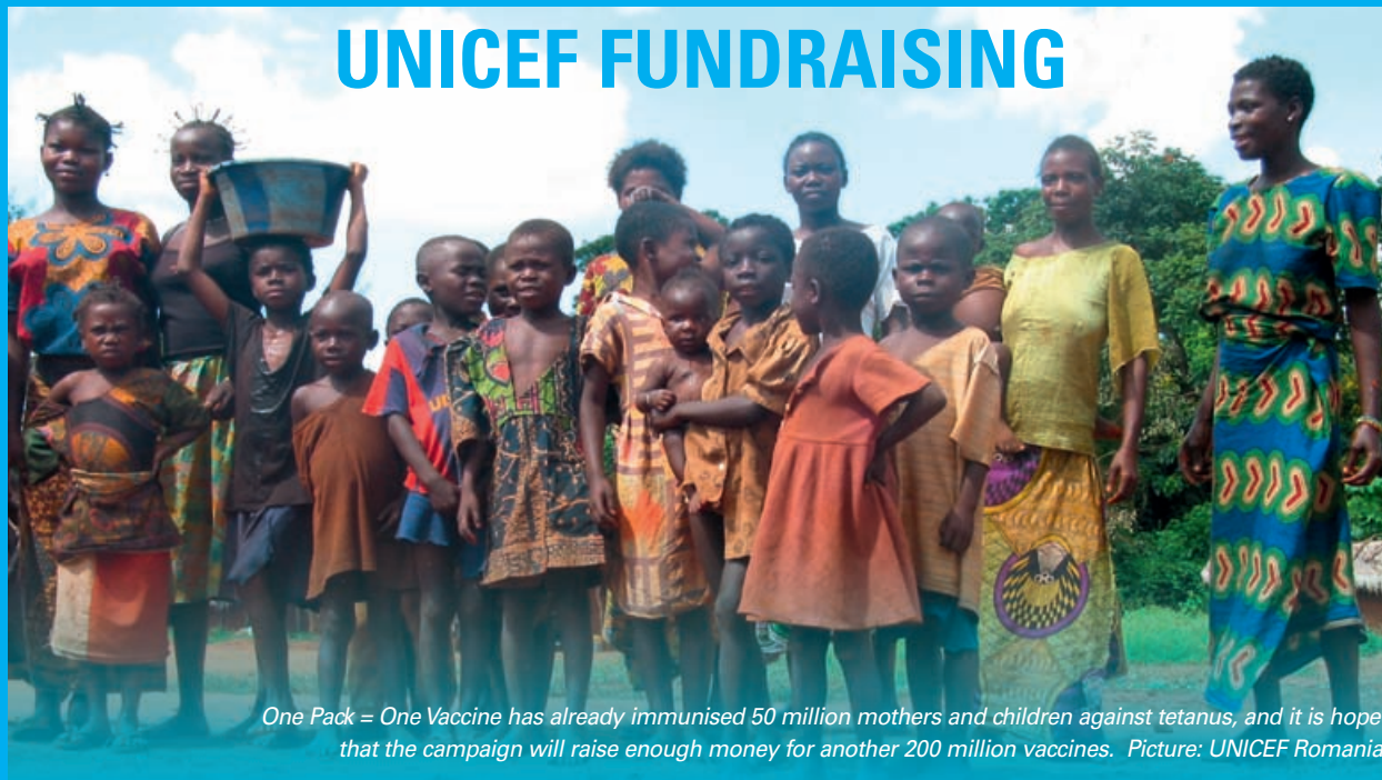
One Pack = One Vaccine has already immunised 50 million mothers and children against tetanus, and it is hoped that the campaign will raise enough money for another 200 million vaccines.