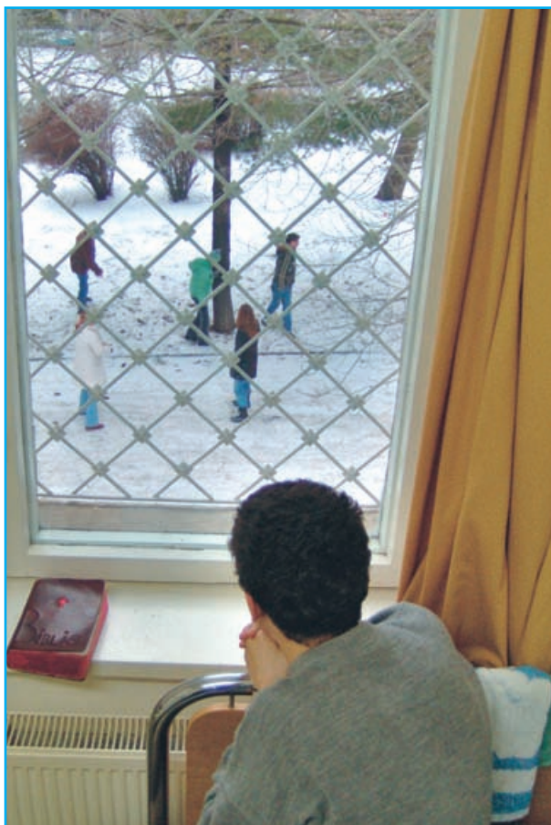
In the mid-1990s half of all children in Europe with HIV were Romanian children.