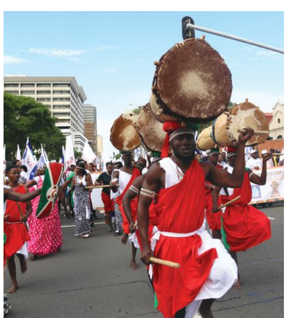
Burundi dancers entertained the crowd during the HIV/AIDS awareness parade.