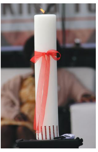
A candle was lit to give hope and look forward to an HIV- free those affected and infected with HIV. South Africa.