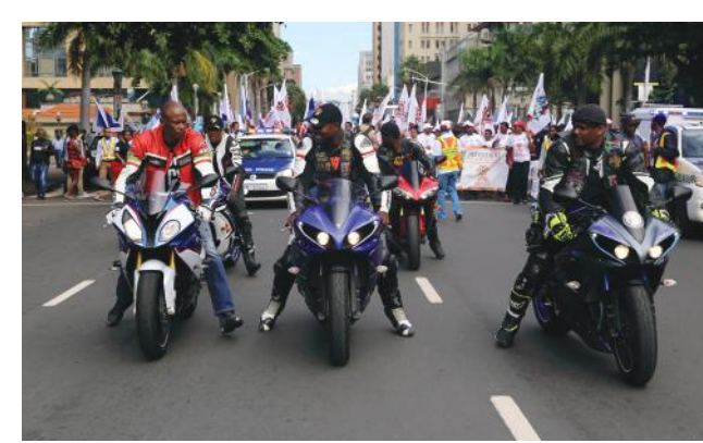
Various forms of entertainment from soulful musicians, Scottish drummers and bikers formed part of the crowd that was spreading the message of hope and an HIV/AIDS free generation.