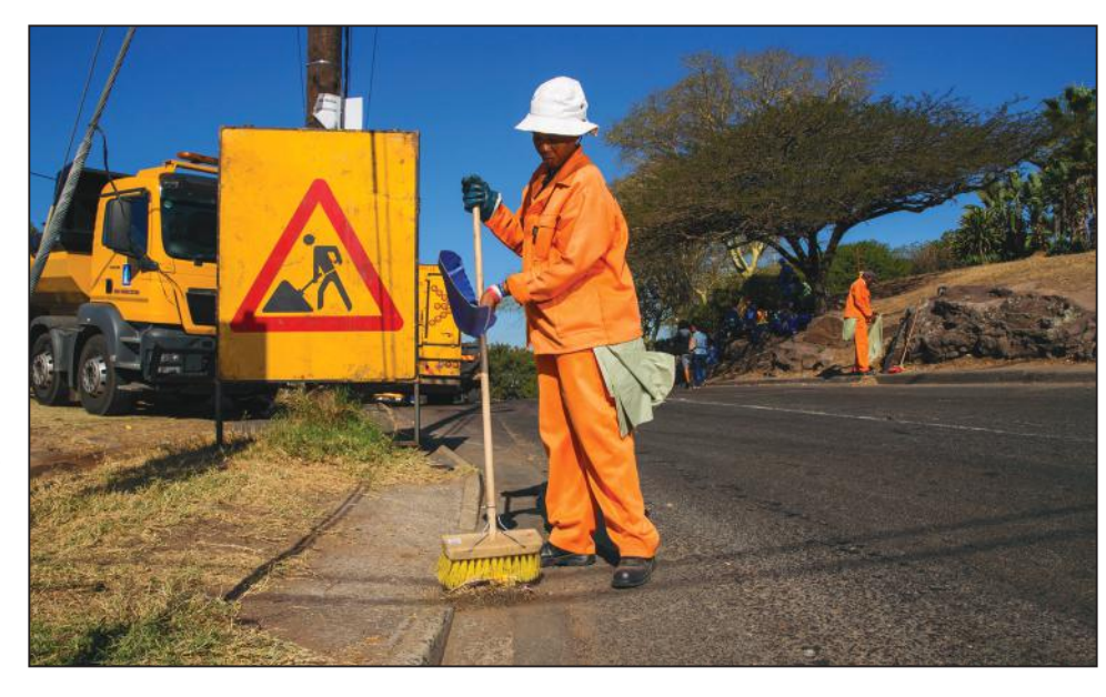
EThekwini residents are urged to comment on the draft Integrated Development Plan for the 2016/17 financial year. The closing date for public comment is 2 May 2016.

plans that will help the City achieve its vision of becoming Africa's most caring and liveable City. Γhese are all inter-related and include developing a prosperous, diverse