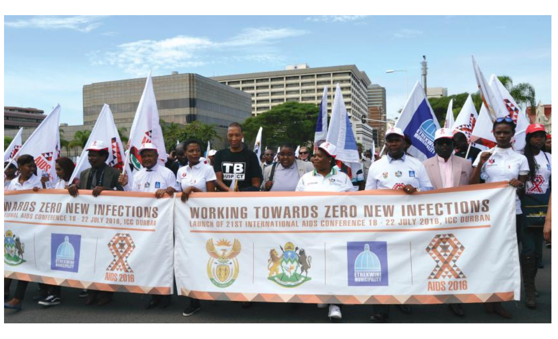
Premier Senzo Mchunu was accompanied by members of the Provincial Executive Council, eThekwini Mayor James Nxumalo, members of eThekwini Executive Committee and Councillors during the parade through the City streets. They were holding banners bearing AIDS messages.