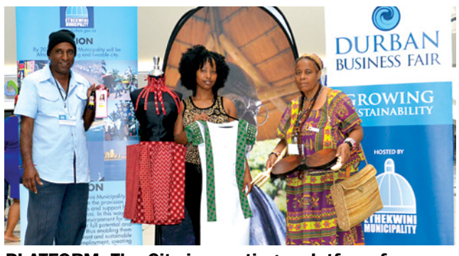
PLATFORM: The City is creating a platform for SMME's to showcase their products and services.

The Fair will expose about 100 small businesses coming from all six wards in the zone. The Fair will include information sharing session,