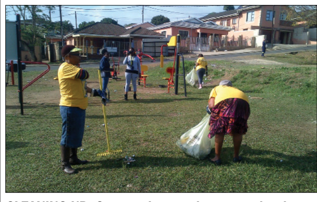
CLEANING UP: Community members were hard at work during a clean-up held at Douglas Saunders Community Park, Hambanathi on Women's Day.