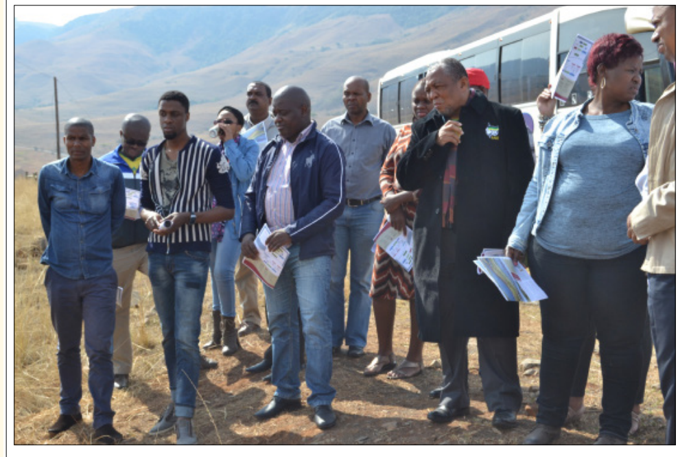
INSPECTION: Human Settlements and Infrastructure Committee members visited a site last week where the proposed Smithfield Dam will be constructed.