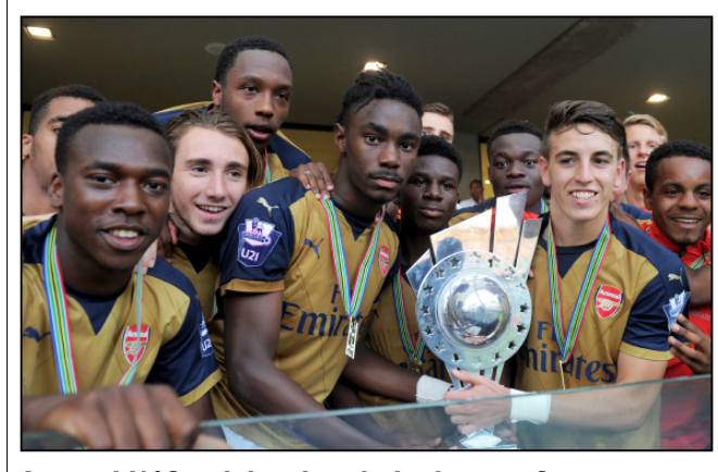
Arsenal U19 celebrating their victory after trouncing PSV Eindhoven in 2015 Final of Durban U19 International Football Tournament.