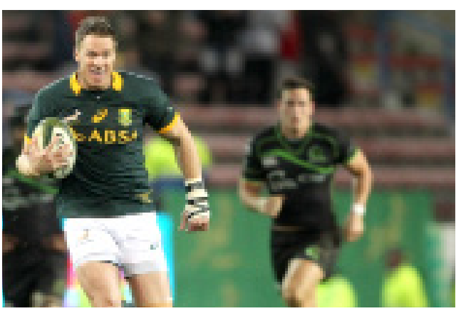
The Springboks will have an open training session on Friday at Moses Mabhida