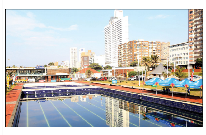
WE'RE READY: Durban has suitable facilities for its international visitors.

nondududzo.ngcongo@durban.gov.zapapama.duntsula@durban.gov.za