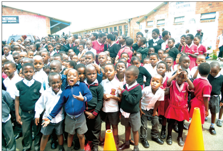
CLEAN ENVIRONMENT: Schoolchildren showed their appreciation through song and dance for all the hard work to clear the bush which was a threat to them.

She went on to say that the enthusiastic co-operation shown by other stakeholders such as Correctional Services and the Department of Education who responded to the City's call to reclaim our spaces was very encouraging as it shows that they care for the wellbeing of our children and the school. "We sincerely hope that this relationship grows and establishes a culture of cleanliness for our learners and community as a whole," said the Principal.