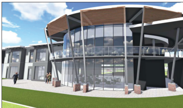
READY TO GO: An artist's impression of one of the centres of the Football academy to be built at the Kingspark precinct.

The academy will be built on the property surrounding Masabalala Yengwa Avenue, Smiso Nkwanyana Road and Jacko Jackson Drive in Stamford Hill.