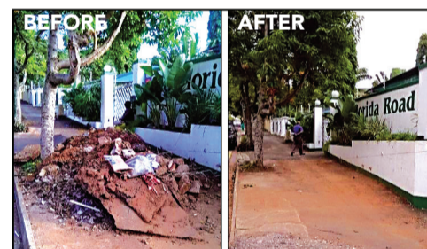
PAVING THE WAY: Sidewalk improvements are one of the maintenance activities done by the UIP.

Other important objectives include retaining existing investment and building investor confidence, creating an environment which supports vibrant and responsible business activity, improving safety, the general environment and quality of life as well