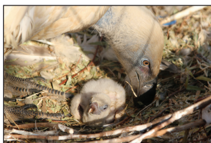
TENDER CARE: An African vulture with its chick.

VulPro appeals to the public to remain observant and aware of vultures in trouble and will assist with advice or guidance on how to handle injured and grounded vultures.