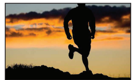
KEEP FIT: The City promotes healthy living.

The route starts and ends at the scenic Green Hub at the Blue Lagoon along the uMgeni River and the edge