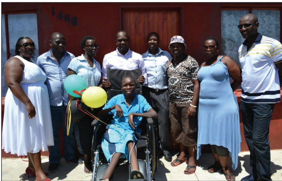
IMPROVING LIVES: The Municipality has programmes aimed at assisting disabled people and other vulnerable groups in the eThekweni region.