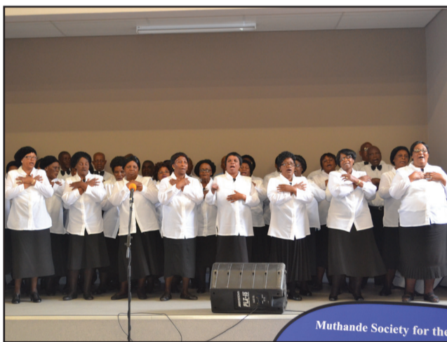
SWEET SERENADE: Senior citizens choir singing one of their melodies.

This is also part of honouring and respecting their rights and dignity," said