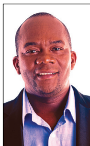
James Nxumalo eThekweni Mayor

Here at eThekweni we are making investing heavily in the upgrade of our transport infrastructure through the transport infrastructure programme known as the Integrated Rapid Public Transport Network (in short: IRPTN). It will feature environmentally friendly and integrated motorised and non-motorised transportation. We are projecting that the budget