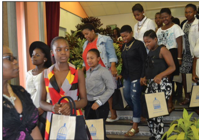
ENGAGEMENT: The City invited young girls to a constructive engagement where they were motivated and encouraged.

This year's theme focused on adolescent girls and the