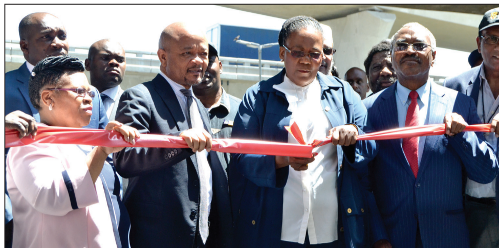
FREE FLOW: Transport Minister, Dipuo Peters (Centre) and KZN Premier Senzo Mchunu, MEC for Transport, Willies Mchunu and Deputy Mayor Nomvuzo Shabalala at the opening of the N2 interchange last week.

The R512m interchange is now allowing free flow of traffic in all directions and relieving the delays experienced in this area. The previous interchange was a conventional diamond interchange where the traffic on the ramps was controlled by traffic signals. Minister Dipuo Peters said